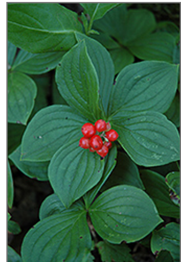
Bunchberry fruit