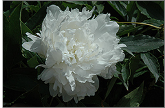
Jubilee Peony flowers