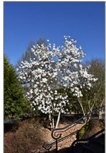
Royal Star Magnolia in bloom