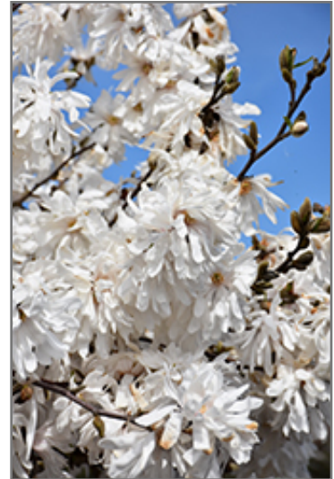
Royal Star Magnolia flowers