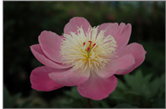
Edulis Superba Peony flowers