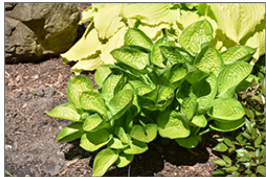
Rainforest Sunrise Hosta