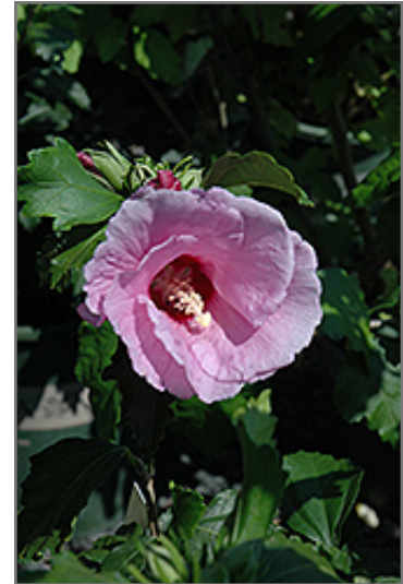
Minerva Rose of Sharon flowers

Minerva Rose of Sharon is recommended for the following landscape applications;