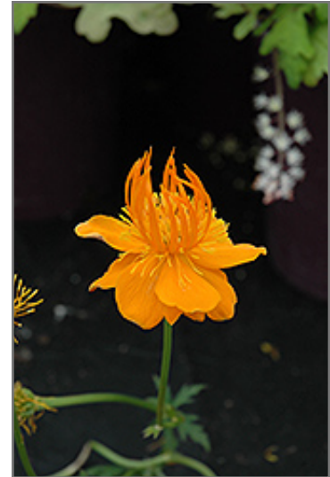
Superbus Globeflower flowers