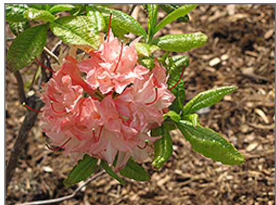
Cannon's Double Azalea flowers