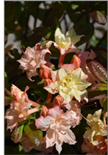
Cannon's Double Azalea flowers