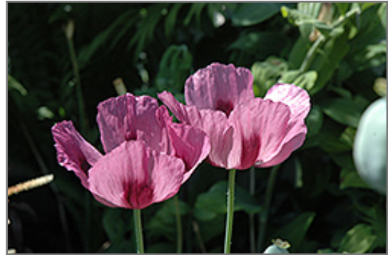
Patty's Plum Poppy flowers