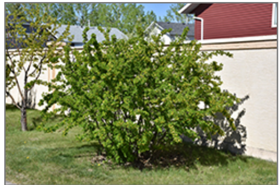
Peashrub in bloom