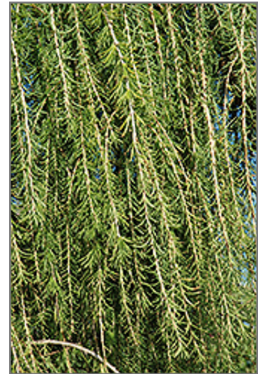
Puli Weeping Larch foliage