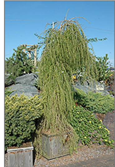
Puli Weeping Larch

This shrub does best in full sun to partial shade. It is quite adaptable, preferring to grow in average to wet conditions, and will even tolerate some standing water. It is not particular as to soil type or pH. It is somewhat tolerant of urban pollution. This is a selected variety of a species not originally from North America.