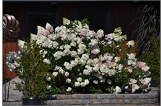
Vanilla Strawberry Hydrangea in bloom

* This is a 'special order' plant - contact store for details