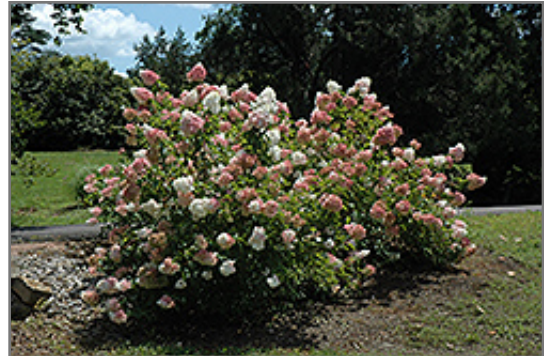
Vanilla Strawberry Hydrangea in bloom