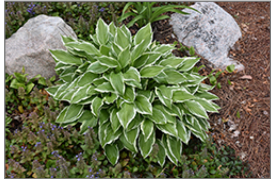
Golden Variegated Hosta

Golden Variegated Hosta is recommended for the following landscape applications;