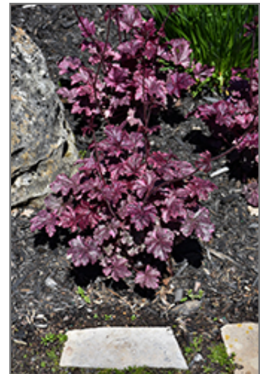
Midnight Rose Coral Bells