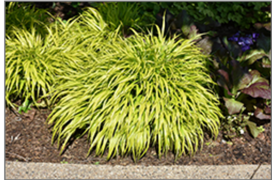
All Gold Hakone Grass