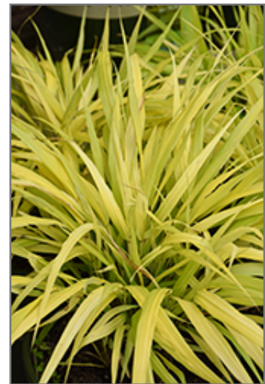
All Gold Hakone Grass foliage