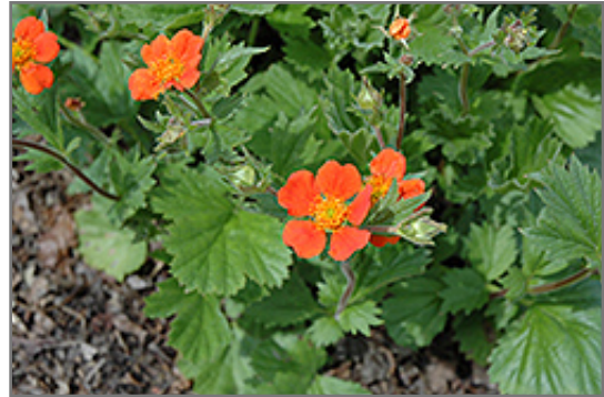
Boris Avens flowers

Boris Avens is recommended for the following landscape applications;