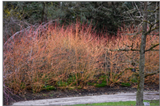
Midwinter Fire Dogwood in winter