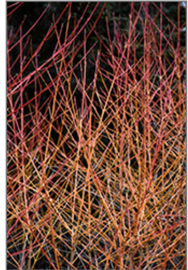
Midwinter Fire Dogwood stems

This shrub does best in full sun to partial shade. It prefers to grow in average to moist conditions, and shouldn't be allowed to dry out. It is not particular as to soil type or pH. It is highly tolerant of urban pollution and will even thrive in inner city environments. This is a selected variety of a species not originally from North America.