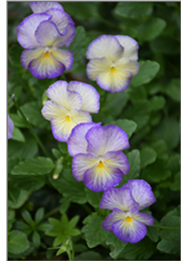
Etain Pansy flowers