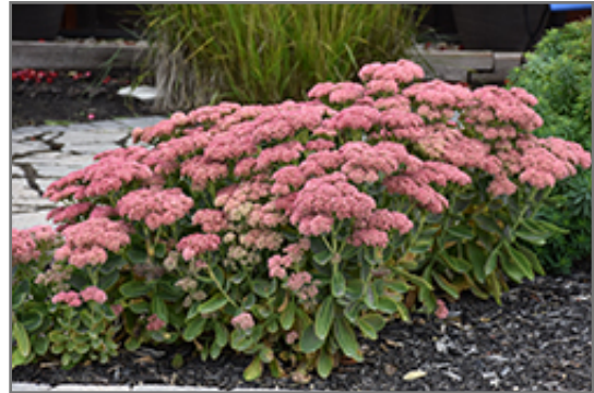
Autumn Fire Stonecrop in bloom

Autumn Fire Stonecrop is recommended for the following landscape applications;