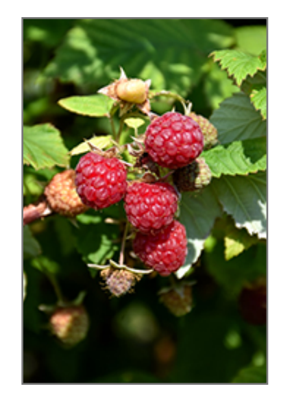
Boyne Raspberry fruit