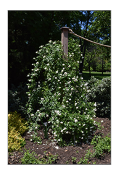
Iceberg Rose in bloom

401 Torbay Road St. Johns, NL A1C 5C9 (709)726-1283 (877)726-1283