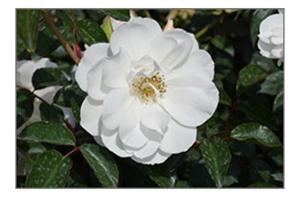
Iceberg Rose flowers

Iceberg Rose is recommended for the following landscape applications;