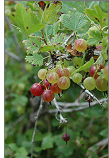
Pixwell Gooseberry fruit

This is a multi-stemmed deciduous shrub with an upright spreading habit of growth. Its average texture blends into the landscape, but can be balanced by one or two finer or coarser trees or shrubs for an effective composition. This plant will require occasional maintenance and upkeep, and is best pruned in late winter once the threat of extreme cold has passed. It is a good choice for attracting birds and butterflies to your yard. It has no significant negative characteristics.