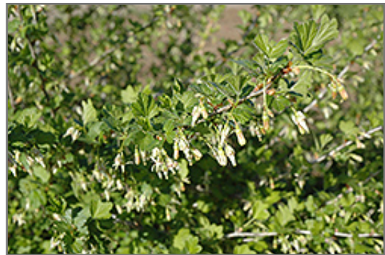
Pixwell Gooseberry flowers