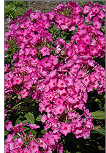
Flame Pink Garden Phlox flowers