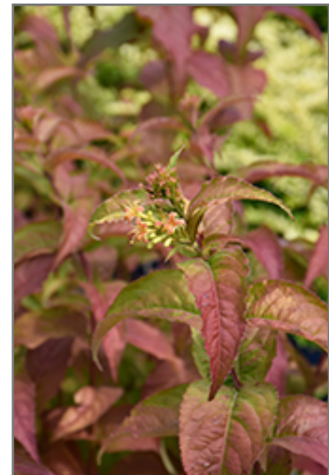
Firefly Diervilla flowers