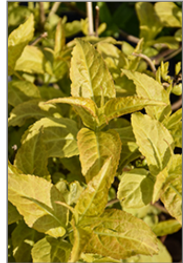
Firefly Diervilla foliage

Firefly Diervilla makes a fine choice for the outdoor landscape, but it is also well-suited for use in outdoor pots and containers. Because of its height, it is often used as a 'thriller' in the 'spiller-thriller-filler' container combination; plant it near the center of the pot, surrounded by smaller plants and those that spill over the edges. It is even sizeable enough that it can be grown alone in a suitable container. Note that when grown in a container, it may not perform exactly as indicated on the tag - this is to be expected. Also note that when growing plants in outdoor containers and baskets, they may require more frequent waterings than they would in the yard or garden. Be aware that in our climate, most plants cannot be expected to survive the winter if left in containers outdoors, and this plant is no exception. Contact our experts for more information on how to protect it over the winter months.