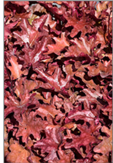
Peach Flambe Coral Bells foliage

This is a relatively low maintenance plant, and should be cut back in late fall in preparation for winter. It is a good choice for attracting hummingbirds to your yard. It has no significant negative characteristics.