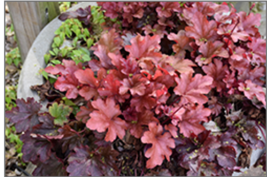
Peach Flambe Coral Bells

Peach Flambe Coral Bells is a fine choice for the garden, but it is also a good selection for planting in outdoor pots and containers. It is often used as a 'filler' in the 'spiller-thriller-filler' container combination, providing a mass of flowers and foliage against which the larger thriller plants stand out. Note that when growing plants in outdoor containers and baskets, they may require more frequent waterings than they would in the yard or garden. Be aware that in our climate, most plants cannot be expected to survive the winter if left in containers outdoors, and this plant is no exception. Contact our experts for more information on how to protect it over the winter months.