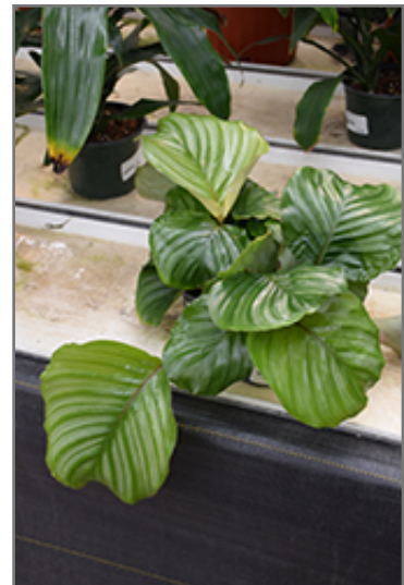
Orbifolia Prayer Plant in full