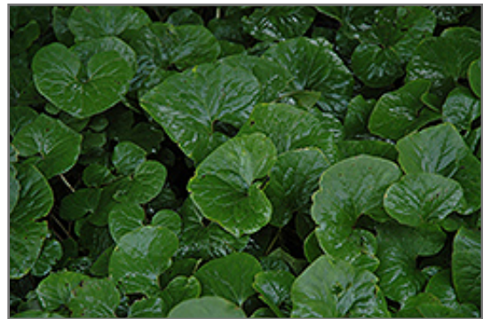
Canadian Wild Ginger