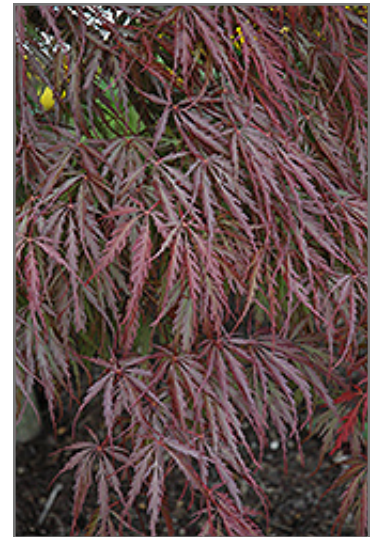
Tamukeyama Japanese Maple foliage