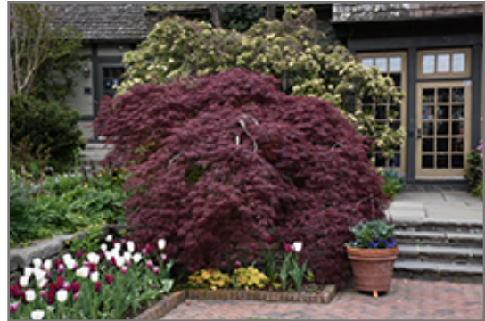
Tamukeyama Japanese Maple

Tamukeyama Japanese Maple is recommended for the following landscape applications;