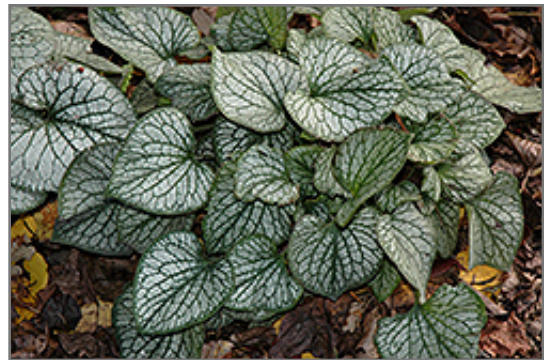
Jack Frost Bugloss foliage