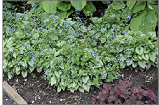
Jack Frost Bugloss in bloom

Jack Frost Bugloss will grow to be about 12 inches tall at maturity extending to 16 inches tall with the flowers, with a spread of 18 inches. When grown in masses or used as a bedding plant, individual plants should be spaced approximately 14 inches apart. It grows at a medium rate, and under ideal conditions can be expected to live for approximately 10 years. As an herbaceous perennial, this plant will usually die back to the crown each winter, and will regrow from the base each spring. Be careful not to disturb the crown in late winter when it may not be readily seen!