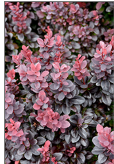
Concorde Japanese Barberry foliage