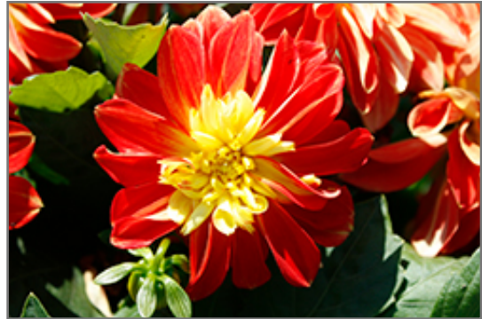
Dalaya Fireball Dahlia flowers