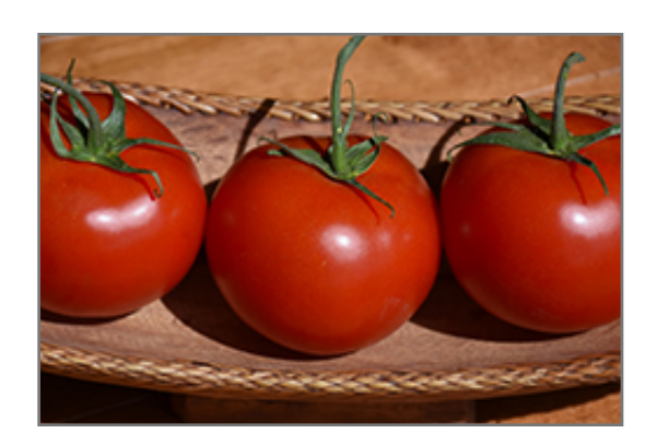
Early Cascade Tomato fruit