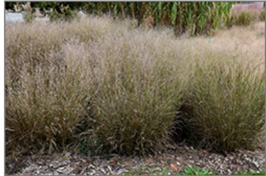
Shenandoah Reed Switch Grass fruit