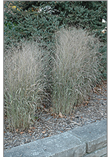
Shenandoah Reed Switch Grass in fall

* This is a 'special order' plant - contact store for details