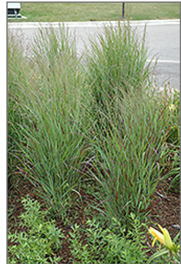
Shenandoah Reed Switch Grass