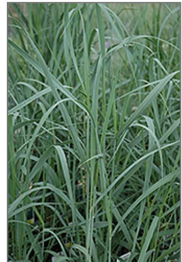
Heavy Metal Blue Switch Grass foliage