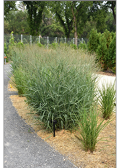
Heavy Metal Blue Switch Grass