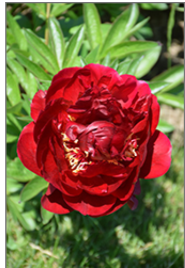
Buckeye Belle Peony flowers