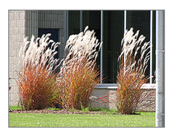
Flame Grass in bloom