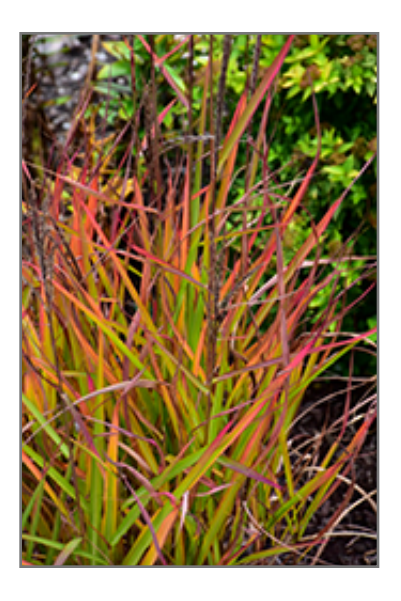
Flame Grass in fall