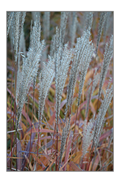
Flame Grass fruit