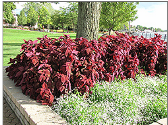
ColorBlaze Rediculous Coleus