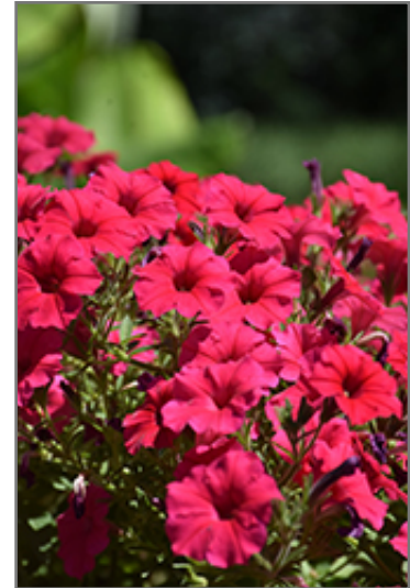
Supertunia Vista Paradise Petunia flowers

This plant will require occasional maintenance and upkeep. Trim off the flower heads after they fade and die to encourage more blooms late into the season. It is a good choice for attracting butterflies and hummingbirds to your yard, but is not particularly attractive to deer who tend to leave it alone in favor of tastier treats. It has no significant negative characteristics.