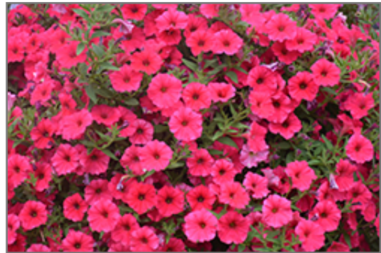
Supertunia Vista Paradise Petunia flowers