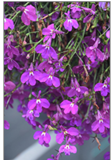
Laguna Ultraviolet Lobelia flowers