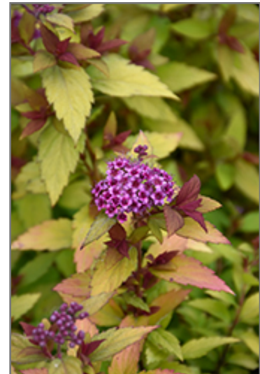
Poprocks Rainbow Fizz Spirea flowers