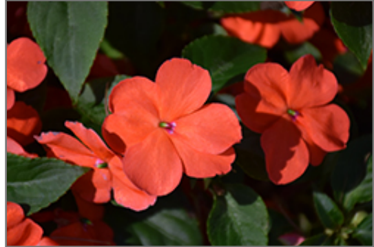
Beacon Salmon Impatiens flowers

Beacon Salmon Impatiens will grow to be about 15 inches tall at maturity, with a spread of 12 inches. When grown in masses or used as a bedding plant, individual plants should be spaced approximately 8 inches apart. Its foliage tends to remain dense right to the ground, not requiring facer plants in front. This fast-growing annual will normally live for one full growing season, needing replacement the following year.