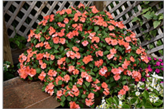
Beacon Salmon Impatiens in bloom

Beacon Salmon Impatiens is recommended for the following landscape applications;