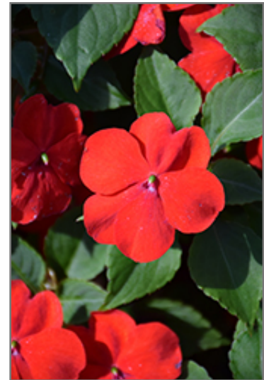
Beacon Bright Red Impatiens flowers