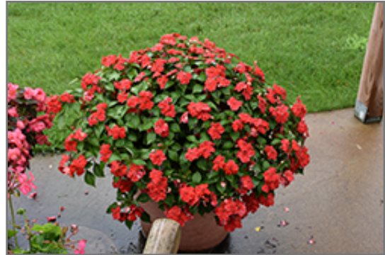
Beacon Bright Red Impatiens flowers

Beacon Bright Red Impatiens is recommended for the following landscape applications;