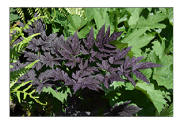
Pink Spike Bugbane foliage