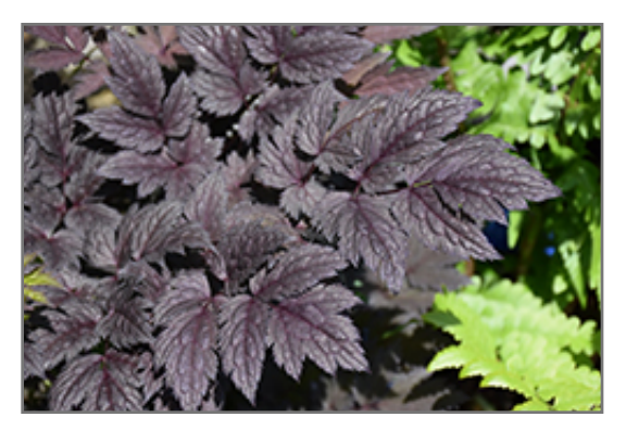
Pink Spike Bugbane foliage

Pink Spike Bugbane is recommended for the following landscape applications;