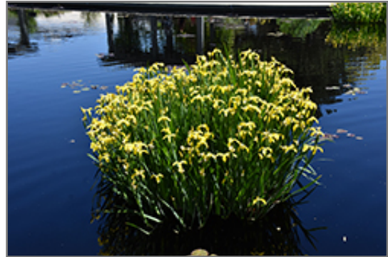
Yellow Flag Iris in bloom