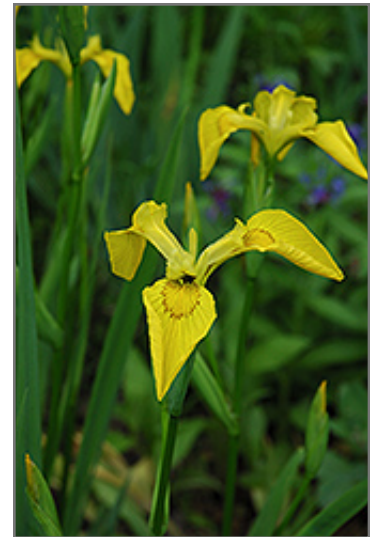
Yellow Flag Iris flowers