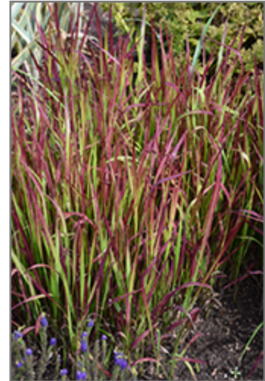
Red Baron Japanese Blood Grass foliage