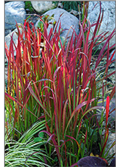
Red Baron Japanese Blood Grass

Red Baron Japanese Blood Grass is a fine choice for the garden, but it is also a good selection for planting in outdoor pots and containers. With its upright habit of growth, it is best suited for use as a 'thriller' in the 'spiller-thriller-filler' container combination; plant it near the center of the pot, surrounded by smaller plants and those that spill over the edges. Note that when growing plants in outdoor containers and baskets, they may require more frequent waterings than they would in the yard or garden. Be aware that in our climate, most plants cannot be expected to survive the winter if left in containers outdoors, and this plant is no exception. Contact our experts for more information on how to protect it over the winter months.