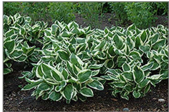
Minuteman Hosta