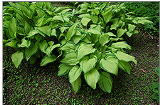
Gold Standard Hosta