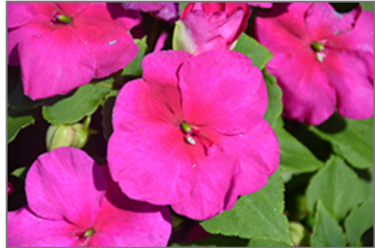
Super Elfin Ruby Impatiens in bloom