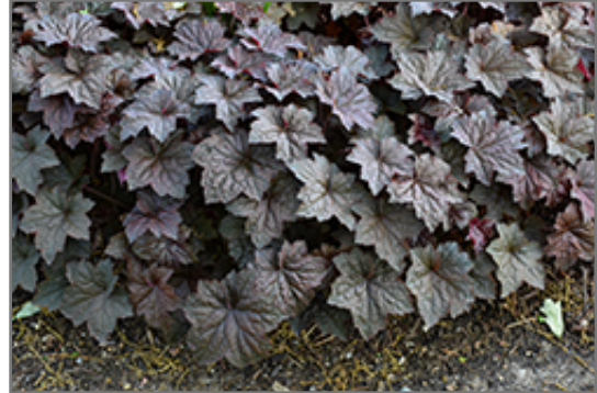
Palace Purple Coral Bells

Palace Purple Coral Bells will grow to be about 12 inches tall at maturity extending to 24 inches tall with the flowers, with a spread of 12 inches. When grown in masses or used as a bedding plant, individual plants should be spaced approximately 10 inches apart. Its foliage tends to remain dense right to the ground, not requiring facer plants in front. It grows at a medium rate, and under ideal conditions can be expected to live for approximately 10 years. As an evergreen perennial, this plant will typically keep its form and foliage year-round.