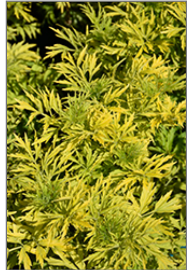
Golden Tower Elder foliage